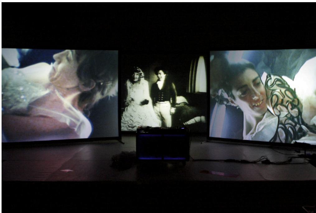
The “wedding scene” near the end.

Near the end, a blue animated figure is dancing on screen while Giovanni echoes the dance on stage, then both female performers climb into the turn table box and disappear. We now see them only on live video camera feed, as they undress/dress into ballet tutus, contemporary female tricksters who seem to play games with the old movie and the Lancelot character (“What a pity you are only a doll,” the intertitles translate him, and then “I can’t believe you are real”). The frame rates, at this point near the end of the performance, seem to have been sped up through reprocessing, and the silent film gains a superb slapstick quality clearly reminiscent of the extraordinary Buster Keaton-like mania of a body getting caught in different rates of speed or the burlesque trompe l’oeil effects of distorted geometries.