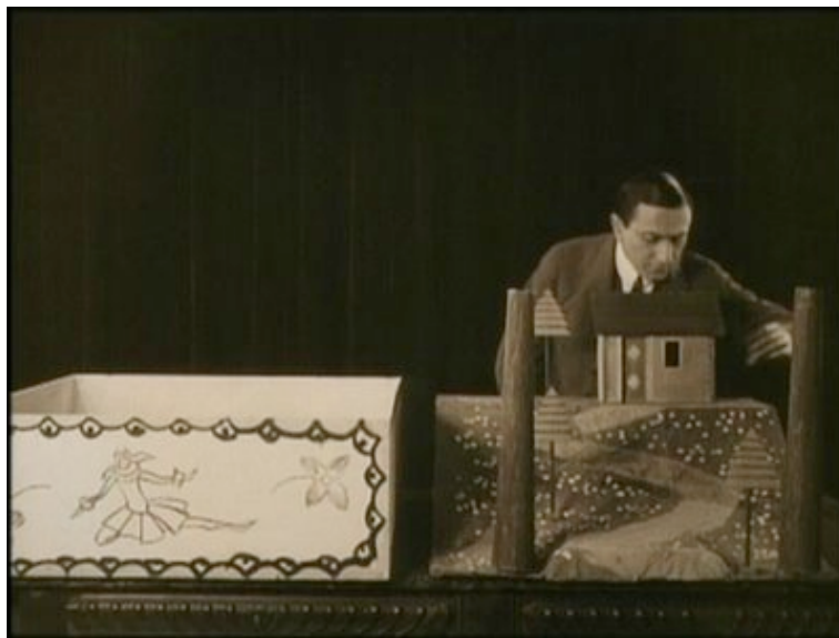
from the opening of Lubitsch's film "Die Puppe". Archival photo.

What kind of projectionist world of dance is this? It certainly works on an entirely different level as many VJing performances in the club scene. There are very few visual/graphic effects here that are not integral to the telling of a story and an overall compositional coherence. We are struck by the effortless ease with which the dancer (Giovannini) seems to inhabit the screen world, initially as a shadow silhouette, then stepping out of it into the stage light, downstage right before the triptych screens, where she becomes a double of "her" film doubles. The sharply contoured rectangles of light almost appear to create screen spaces on the floor where the dancer slowly creates images of a body animated as if by invisible machinations, as if controlled by something outside of her. Dressed only in her underwear, and her slender, androgynous body perceived in stark contrast with the opulently dressed women characters on film, Giovannini's first onstage appearance creates a sense of tenderness and even unease.