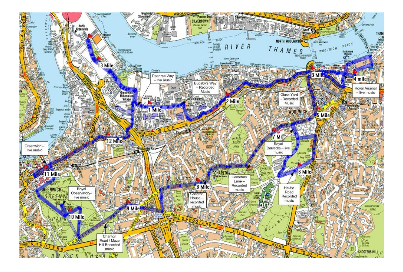
Figure 1: Routemap of the 2009 London Run to the Beat event.