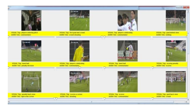
Fig.3. Interface for end-users to prioritize the scenes

Therefore, based on the selected priority level for each scene by the end users, the primary average scores are updated. The scores of frames belonging to the scenes by the level 0 of interest will not be altered at all. However, in the scenes with a level 1 priority, the grades for the frames which their primary assigned scores are the highest among the frames of that scene, will be increased by 20 percent (to the maximum value of 12). This is done in order to potentially escalate the probability of incorporation of the highest quality frames of those scenes into the eventual video digest. The updated mark for the frames belonging to the scenes with the highest level of priority for a particular end-user will be recalculated in a different format. The grades for the frames which preliminary were scored the highest in each scene, will be upgraded to the maximum possible value (12). In fact, this would increase the chance of definite inclusion of the highest quality segments of those particular scenes (with level 2 priority) in the final summary. However, the marks for the frames of these scenes whose scores are not the highest but nonetheless manage to exceed the respective scene's average scores will be boosted by 20 percent as well (to the maximum of 12). The scores for the remaining frames of these scenes will remain unchanged.