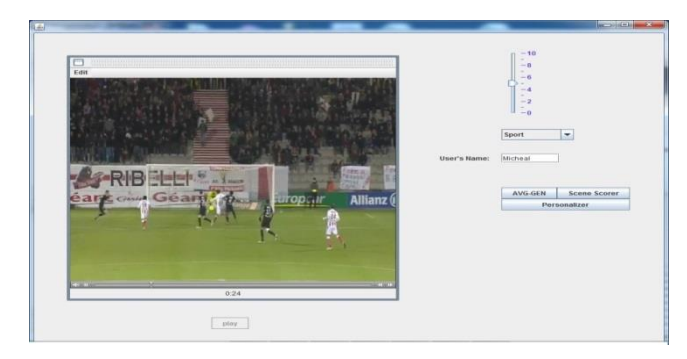
Fig.1. Interface for video experts to score the video frames

This phase is responsible for capturing an end-user's priorities in a particular video. As a result, prior to the generation of any final summary, end users will be provided with some visual and textual information regarding the content of the existing video scenes.