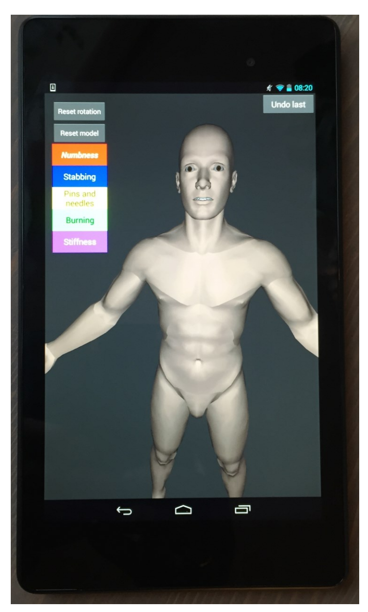
Figure 2 App running on a Nexus 7" tablet device