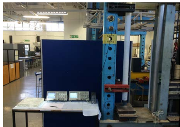
Figure 1 Impact resistance test set up including oscilloscope

Repeated drop weight method was employed to investigate impact resistance of HFRCs on panels. The repeated drop weight impact test set-up is shown in Fig 1. The testing system consisted of a stainless steel rod as the drop weight of 6 kg from the height of 0.8 m with a cylindrical body diameter of 4 cm which was connected to a tensile wire that can be manually controlled, and kept vertically by a steel wire fixed to the pulley installed on frame. Steel rod front head had a spherical shape and the impact surface area had been reduced from the diameter of 4 cm into 2 cm, which modified it to act more as a point load at the moment of impacting. A central impact was achieved by means of a plastic