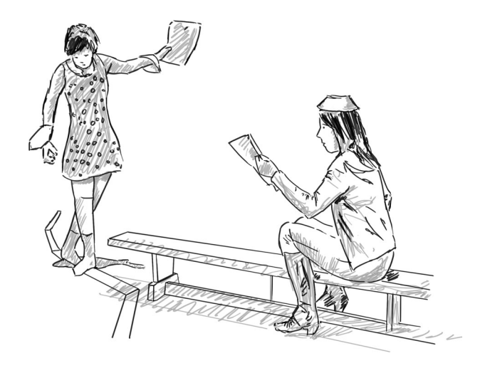
Figure 2. Tracing the sticky tape trail.

Marta reads her lines extra slowly, like a desperate attempt to convince her audience (this is me, watching the footage now) she is safe. She gets up from the bench and traces the sticky tape trail on the floor with light, gracile movements, as if marking new territory through dance (Figure 2).