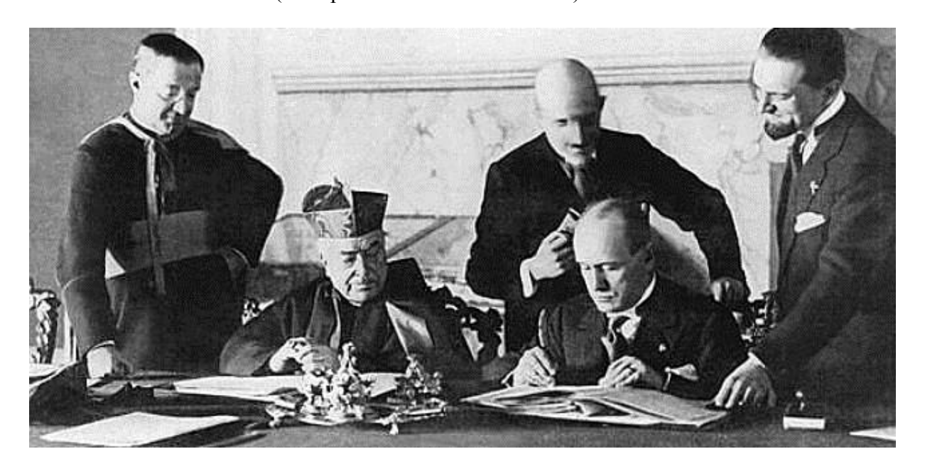
(In the photo: Benito Mussolini undersigns the Church and State Lateran Agreements. 1929)

However, the 'Conciliazione' did not appease the tensions between Mussolini and the Vatican. The relations between the Vatican and the fascist regime, in fact, deteriorated during 1929–32 soon after the 'Concordat' (third part of the Lateral Treaties).<sup>29</sup>