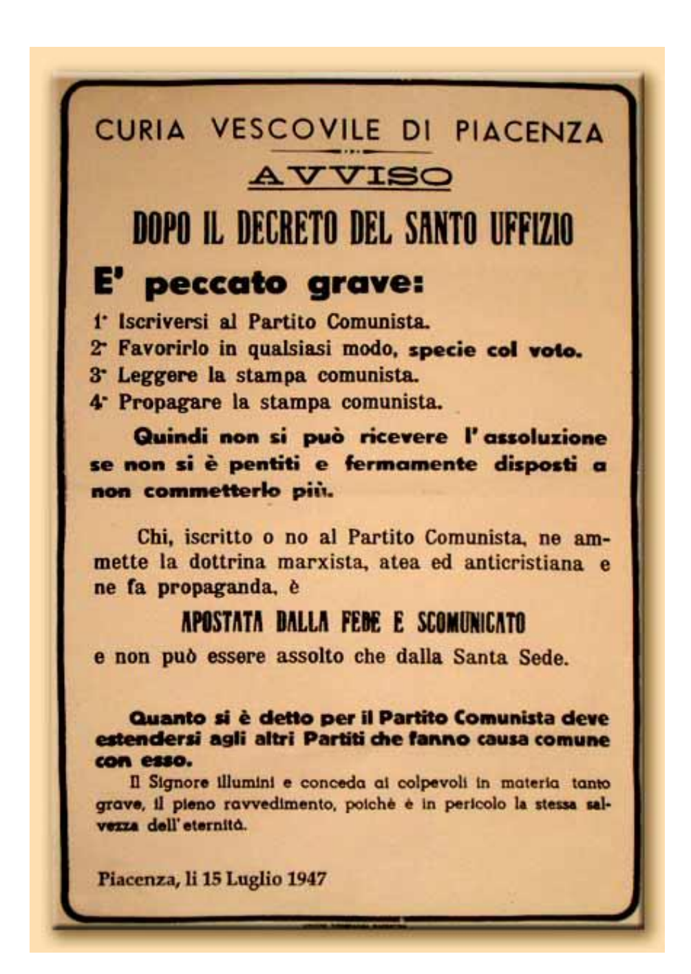
Figure 1 . Summary: The Holy See officially commands that it must be considered serious sinning: 1. taking a communist membership, 2. making political propaganda in favour of the communist/Marxist ideology and support its actions, especially by means of electoral vote, 3. reading communist press, 4. publicising communist books. The Vatican threatens excommunication for those who do not respect the Vatican's vetoes. Forgiveness can be granted exclusively by the Catholic Church itself. City of Piacenza, 15 July 1947.