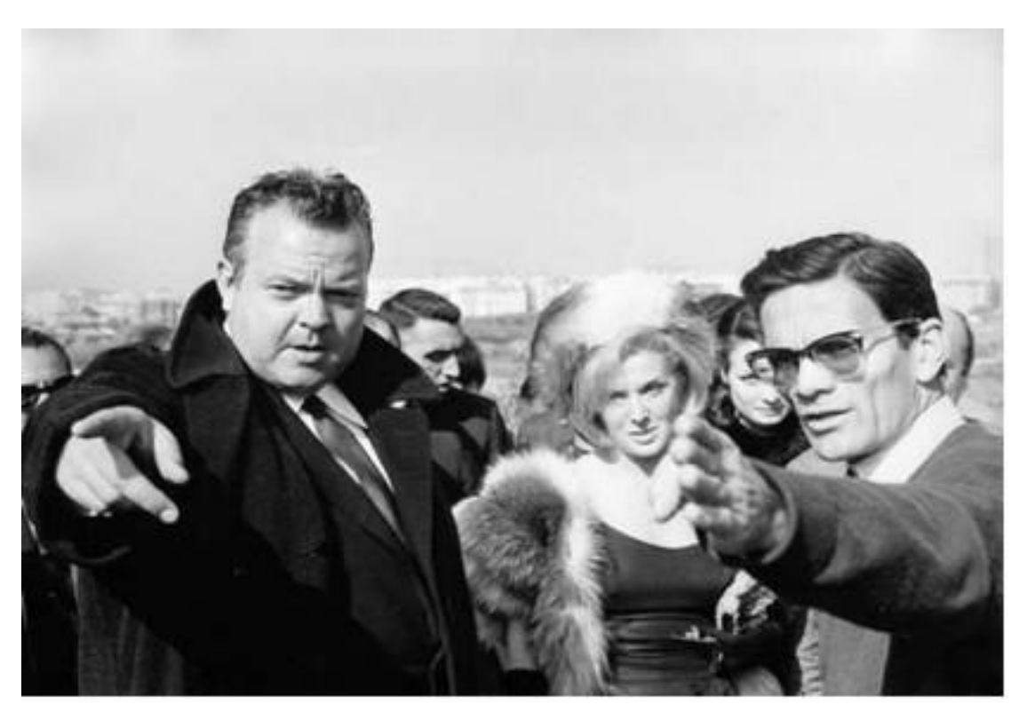
Pasolini, Orson Welles and Laura Betti on the set of the film La ricotta (Cinecittà, 1963)