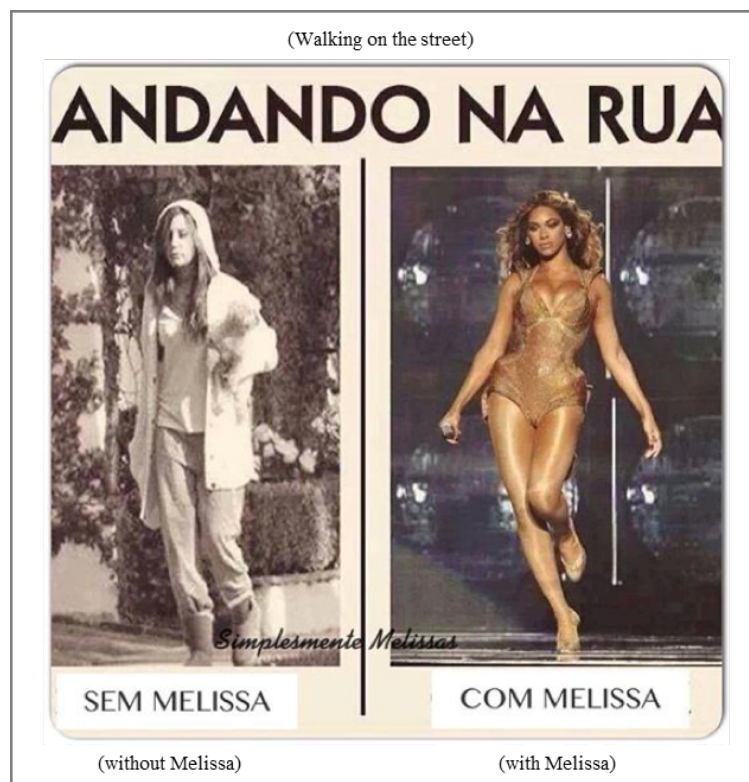
Figure 6: Simplesmente Melissas [Simply Melissa] – Materialization of cultural practices

sense of collective identity. Illustrating what it means “to Melisse,” an image in black and white shows one girl walking crestfallen in a hoody and slippers next to an iconic photo of pop singer Beyoncé in which she walks on stage in high heels, wearing a golden outfit, her hair flowing. In this image, the cultural ideal of shoes as objects gifted with transformational power [McDowell, 1989] allies with consumers’ imagination and emotional energy to materialize the cultural practice of Melisseiras. The meme materializes the feeling and emotional energy contained in imagining that “melissing all around” is equivalent to feeling like a pop diva.