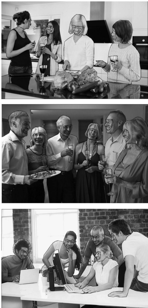
Figure 1. Example stimuli from Experiments 1 and 2. Black lines represent areas of interest (AOIs). In both experiments the images were displayed in colour.

of interest (AOIs) were drawn onto the 20 experimental images using a freehand marquee tool (analyses were not performed on the five filler images). Three sets of AOIs were drawn onto each image (see Figure 1). The first set contained three AOIs: the background of the image (all areas other than the bodies and faces of the characters), the bodies of each character (taken from below the chin), and the faces of each character (including outer features such as the ears and hair). Second, the latter region was further divided into two separate AOIs, in order to investigate attention to the inner (i.e., the area covering the eyes,