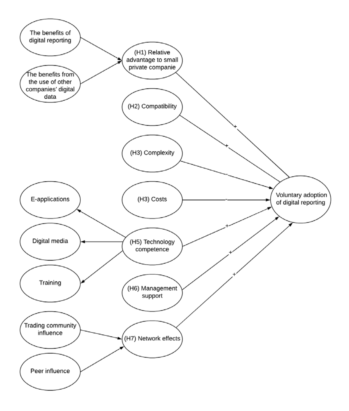
Figure 1 The theoretical model