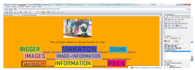
Fig. 1. STP user Interface