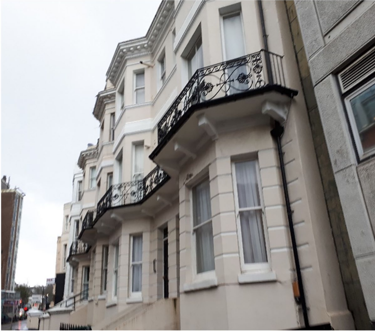
Figure 3. Multi-occupied Victorian houses.

The first two authors collected 25 interviews and took over 50 photographs of the town, providing a rich visual depiction of Hastings as a place of work, leisure and as seaside resort. Neither researcher had visited Hastings before the research took place. We sought to capture visual imagery of Hastings as a ‘struggling’ but still popular seaside resort with its particular topography, culture and history as described above. At the same time, we sought an appreciation of the surroundings from the perspective of an outsider, enabling a fuller emergence into the locality.