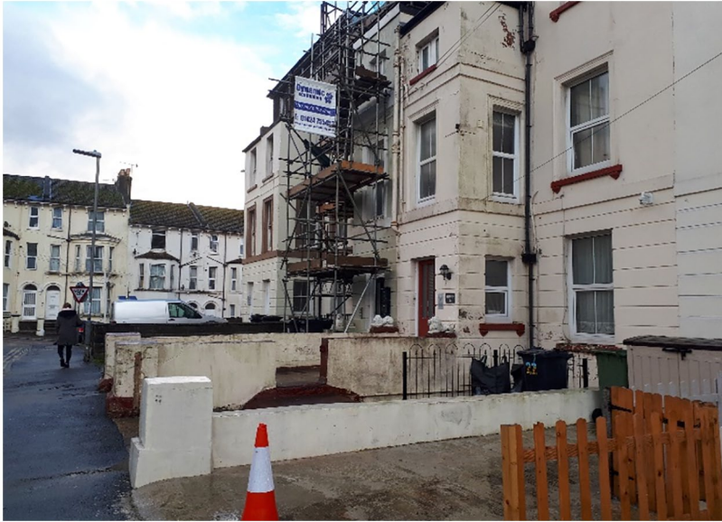
Figure 4. One of the many houses under renovation.

transport connectivity have implications for employment opportunities and mobility, contributing to a dependence on local work.