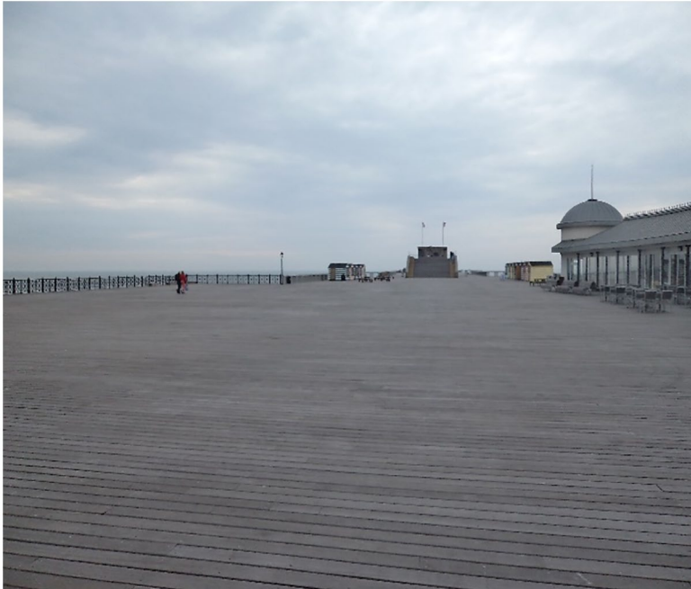
Figure 1. Hastings pier.

performance and cultural venue (Moore, 2019). The resultant modernist and sparse structure (Figure 1) received scathing reaction from Tom, long-term resident and participant in the study, who categorised it as a ‘landing strip’.