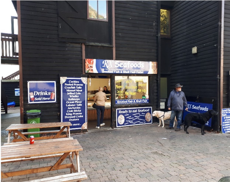
Figure 5. A stall selling cockles at The Stade.

starts to the day at sites, which can be out of town, leading potentially to the forgoing of work opportunities outside the area. As electrician Nick remarked regretfully, ‘I would have liked to move to Crawley (a large, airport town 50 miles inland) because there’s a lot more high-tech companies and that might have given me more opportunity’ but practical difficulties of moving, lack of transport and claims of family ties dissuaded him.