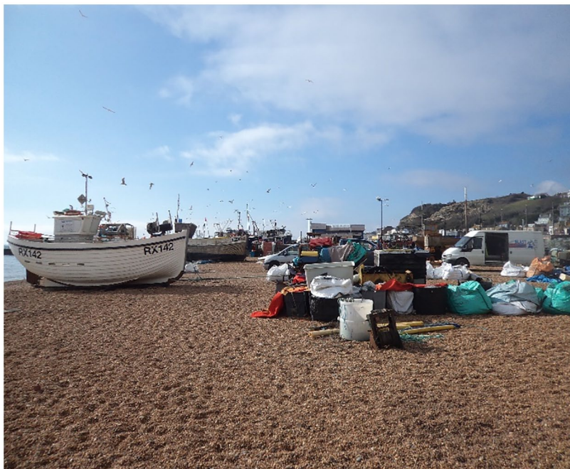
Figure 6. A fishing boat on The Stade.

fishing dock in Hastings and help the fishing boats, it's a very close-knit family thing' (Neil, plasterer) (Figure 6).