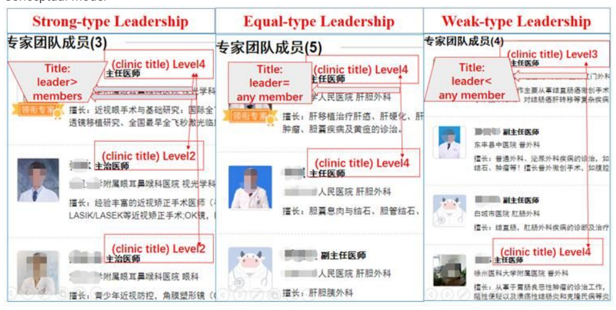
Figure 2 Three types of leadership in online MTs

Note: The first person is team leader in each MT, and others are members.