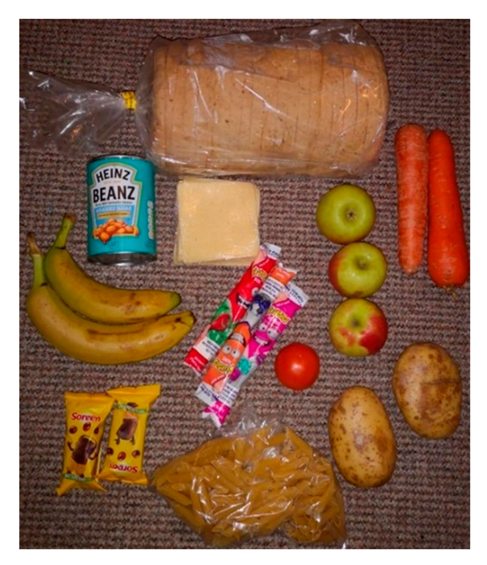
Figure 1. Free school meal food replacement parcel for one week's worth of lunches (Whittaker 2021).

have been unable to access food, support and items needed to engage in education' and without sufficient food, the possibilities for a child to learn are significantly diminished.