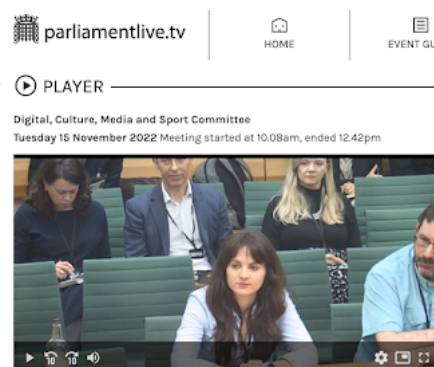
This Kat visiting Parliament

For ease of update, this Kat has compiled the table below, which sets out what the DCMS Select Committee Economics of Streaming Report recommended, how the government responded and the current progress in each area.