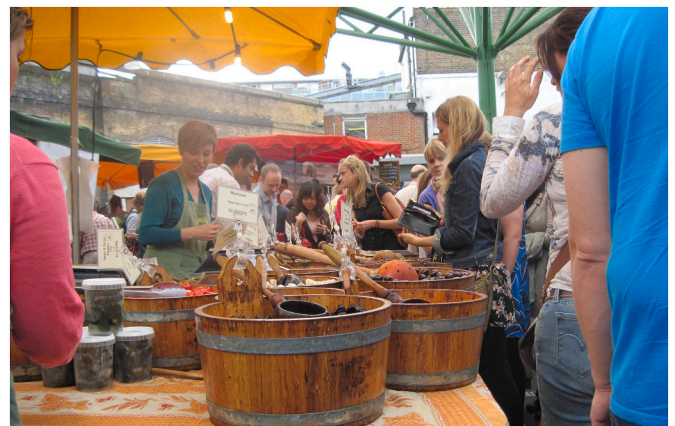
Fig. 4. Image of food shopping at local market.