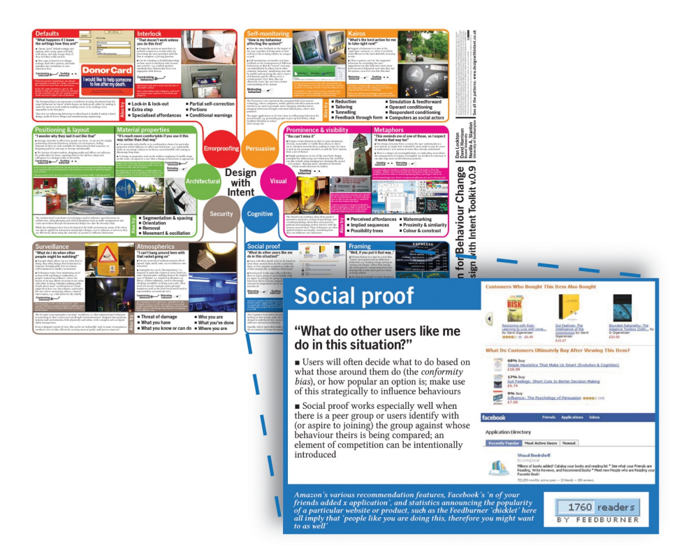
Figure 1. The 'toolkit' layout used for the inspiration mode, with a close-up of Social proof , one of the patterns.

available online as a reference for designers ( www.designwithintent.co.uk ). In prescription mode, the designer expresses the brief in terms of one of a set of 'target behaviours', each of which has particular design patterns associated with it—a more TRIZ-like approach (Altshuller 1996; Jones et al. 2001; Craig et al. 2008). The modes are demonstrated and explained in more detail in a forthcoming article (Lockton et al, in press); from the point of view of this paper, the results of applying both modes to a single brief will be aggregated.