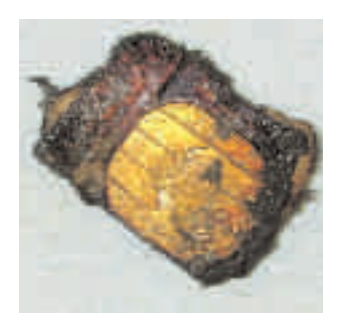
SIM card recovered from fire

EPSRC funded researchers at ETCbrunel and UCL Electronic Engineering, in association with The Forensic Science Service, have been working to determine the level of retained data within a heat damaged SIM card or