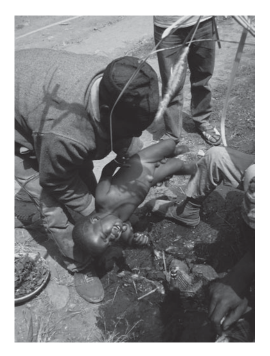
FIGURE 4 A woman's planting knife with a lump of incense atop its handle is planted in the water under the arch. As it burns in the water the healer swings the child around the knife handle

a locally smithed hoe are placed under the spear and elephant stalk arch, between the two holes. The healer utters a prayer and blows the horn again at this point. The extremities of the live fowl (wings, feet and beak) are passed across the water in the holes, then across the lips of the mother and child. The healer performs divination with the two flower buds again. While all present hold the assistant's arm, he kills the fowl bloodlessly by compressing its chest against the ground. Down-feathers are then plucked from it and put on the place along with \eta k \epsilon \eta leaves ( Dracaena sp.). The healer and then the others sprinkle camwood on the place.