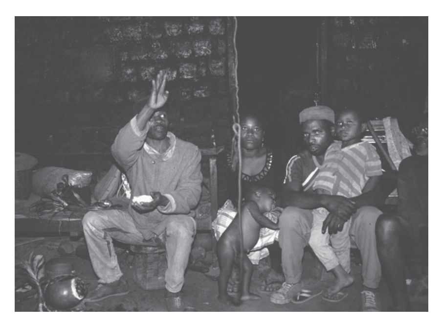
FIGURE 3 The healer throws little balls of njimte into all four corners of the room, onto the ground near the calabashes and into the fire

The healer pours wine on the doorstep, praying as he does so, then adds more to the calabash. The healer then throws little balls of a ritual mixture of cocoyam, palm oil and ground pumpkin seeds known as njimte into all four corners of the room, onto the ground near the calabashes and into the fire. At this stage, the fiar' k\partial\gamma en is lit. The healer then paints stripes onto the door lintel; three sets of three: these are known as the ciphers of the calabash ( eniar' k\partial\gamma en ). Two snail shells are then placed in the calabash and 'read' by the healer according to how they float there. The mother, the child and others present then come to pour wine into the calabash and drink from it.