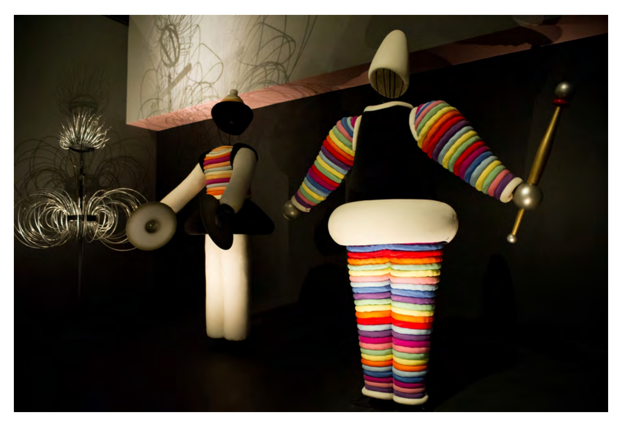
Oskar Schlemmer, Figurinen (recreations) (2012).