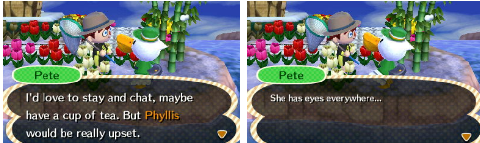
Figure 7: Example of a reference made by one NPC to the disembodied awareness of other NPCs in the game.

Some NPCs in the game occasionally make, presumably inadvertent, references to this trait of the game's AI in interactions with the player (see Figure 7). The length the game goes to in order to present a coherent and pleasant game world with natural and 'embodied' characters makes these types of moments stand out.