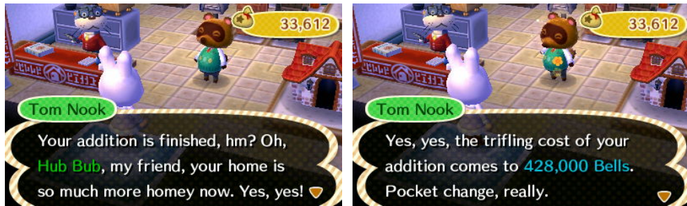
Figure 6: Left: encouraging dialogue after renovations are complete. Right: the ‘trifling’ cost of renovation work.

In the above screenshots, the player is coaxed into accepting continued and added debt by buying into the idea that larger homes are more ‘homey’. The dialogue presented by Tom Nook (see Figure 6) particularly serves to highlight the uncanny play on adult anxieties. The NPCs tell players to always strive for a larger house, and also continuously encourages them to remain indebted by almost never describing their house as being good enough. The NPCs’ desire and admiration for space and symbolic wealth, combined with the loans involved in house expansions since they cannot be made in cash beforehand and only in credit afterwards, evokes anxiety and create a sense of ineffectualness simultaneously. The goals successful adults are meant to achieve, such as being debt-free homeowners, are always just out of reach.