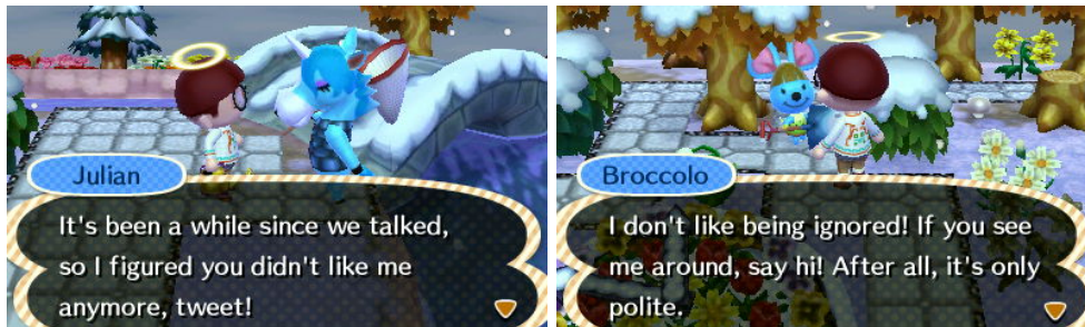
Figure 8: Examples of introductory dialogues with villagers after longer periods of not playing the game.

The other Heideggerian concepts of ambiguous states of being and living (Heidegger 2000) primarily emerge as a result of the game progressing by "playing itself" without any exertion of agency from the player. This player independent progress is expressed partly in the state of the village itself where flowers wilt, seasons change, and weeds grow as time moves forward. But, the passage of time is also felt emotionally by the villagers themselves. If longer periods of time are allowed to pass between player-NPC interactions, the NPC will initiate the dialogue by stating exactly how many days, weeks, or months it has been since their last chat or that they have been saddened or upset by the player's absence (see Figure 8).