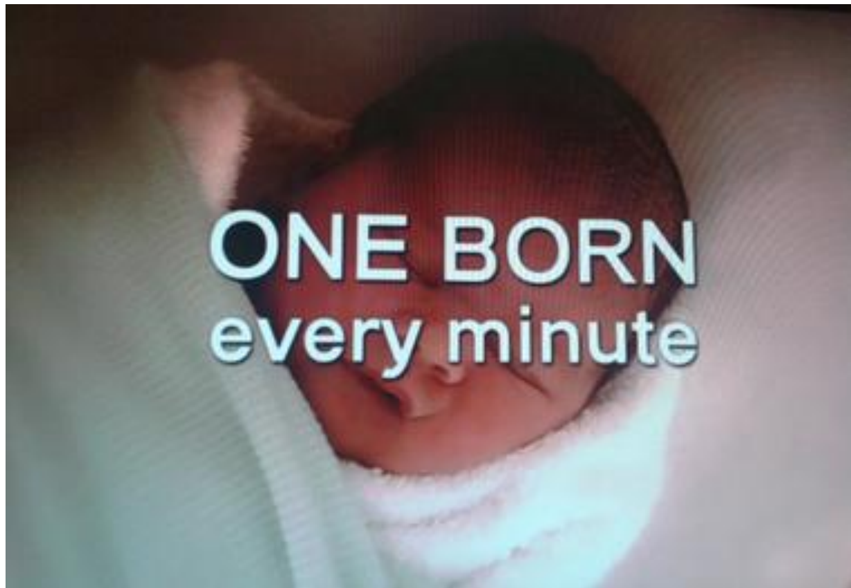
One Born Every Minute

Austerity does not necessarily have to be neoliberal and neoliberalism does not have any necessary connection to austerity. But taken together they represent a toxic combination, one that attacks us body and soul.