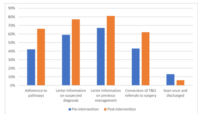
Figure 1 Summary of audit results on the quality of GP referrals. GP, general practitioner; T&O, trauma and orthopaedics.

ARIMA analysis to establish whether there was an effect of the intervention revealed no statistically significant