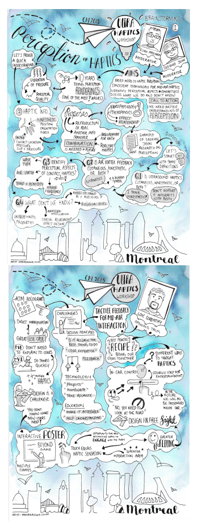
Figure 3: Sketches from [17]. Credit and Thanks to: Dr Makayla Lewis, Sketch Artist www.makaylalewis.co.uk

suggest new design guidelines, and formulate and initiate collaborative research studies for participants to embark on post-workshop. The workshop's main goal therefore is to bring together the growing mid-air haptic research community and industry experts (see CHI2016 and CHI2018 workshops [17, 18]) to advance the challenges and opportunities related to the design of next generation mid-air haptic interfaces for interactive digital signage and kiosks. Namely, we are interested in at least these questions: