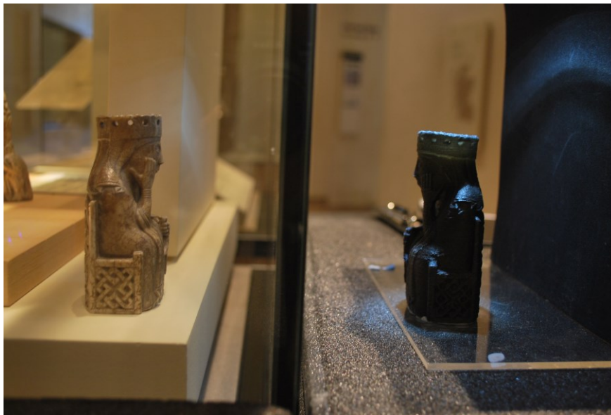
Fig. 1. The Lewis Chess piece behind the glass and the mirrored 3-D printed replica

The replica was created by laser scanning the original artefact, mirroring it to the original (i.e. lateral inversion of the scan data before printing) so that the user's experience would match the object in the case. The need to present mirror images as part of virtual reality and co-location interfaces is part of virtual reality issues [3] [18]. The replica was then painted black so that it would absorb light thereby reducing its reflection in the glass case. The replica is placed facing the chess piece at an equal distance from the display glass (Fig.1). When a user places her hands on the replica and concentrates her gaze at the original piece behind the glass, she can see her hands reflected in the glass apparently touching the real artefact in the display case (Fig.2). Because she sees the actual artefact (and her hands) and touches the replica she experiences the sensation that she is actually touching the artefact itself. The illusion is further strengthened by placing a cover over the replica to shield it from the user's direct gaze. This cover also contains a light to illuminate the user's hands so that their reflection is brighter.