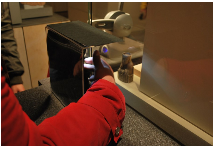
Fig. 2. Visitor interaction with the replica. Her gaze is concentrated at the original artefact behind the glass