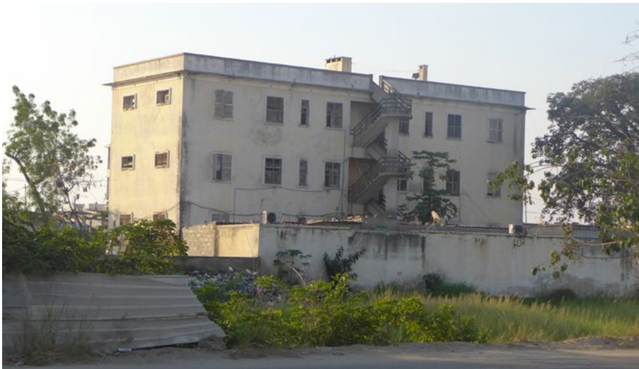
The iconic Três Pisos buildings of the CFB in Compão.

While neighbouring Benguela, the provincial capital, had been a centre of the Portuguese Atlantic (slave) trade since the 1600s, Lobito is very much the product of twentieth-century colonial extractive capitalism. The city was built around the port, taking advantage of a natural deepwater bay sheltered from the open ocean by its Restinga (sandspit); this orientation still marks the spatial layout of the city today. The port served as terminus of the Benguela Railway, which by 1931 linked the Zambian Copperbelt and the mines of Katanga with the Atlantic coast and further to the European industrial heartlands. So from the outset, the city was geared towards the needs of the port and the railway.