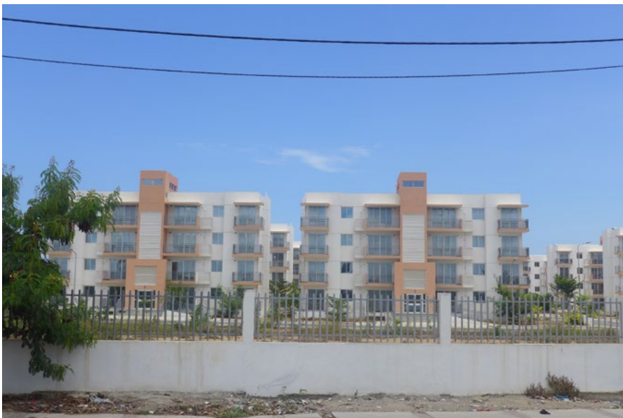
New flats for port workers near the Military Academy.