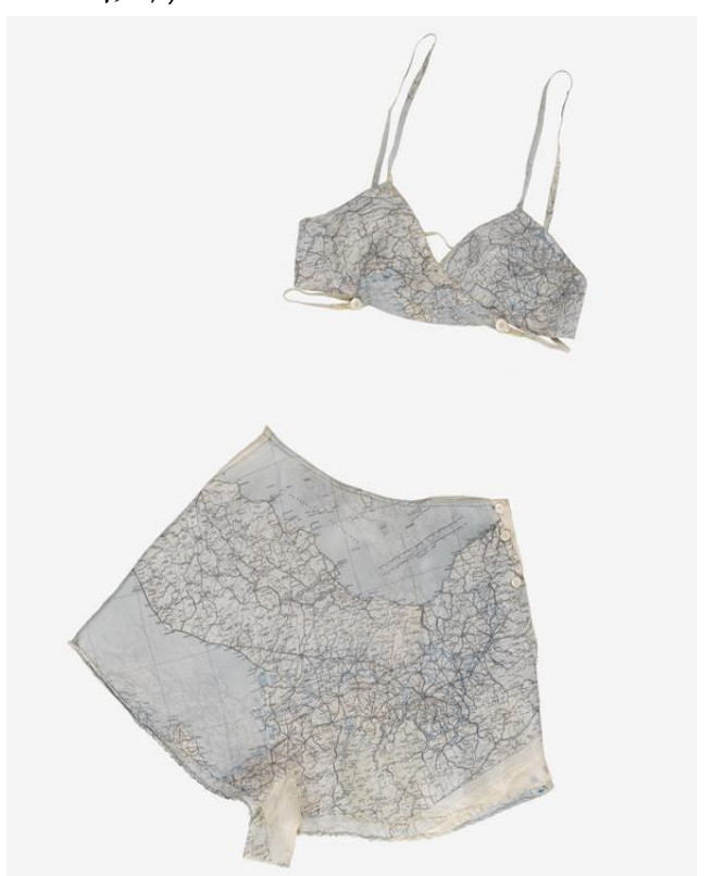
Figure 4. IWM, EPH 10930: Ladies bra and knickers set made from silk escape maps of Italy.

with" (2006, 211). Even when there is little documentation associated with it, a museum object does still communicate with the observer. However, the possibility to establish a careful dialogue with its physicality might produce alternative interpretations of its history. What is certain is that when they enter a museum collection objects lose their original purpose – or their "place in life," as Assmann called it – and are given the chance of a second life that prolongs their existence (2008, 103). Thanks to the new exclusive status they acquire, museum objects carry and transmit different meanings, and prompt a dialogue with visitors interacting with the rest of the collection, thus acting as contact zones themselves (Poulter 2014, 27).