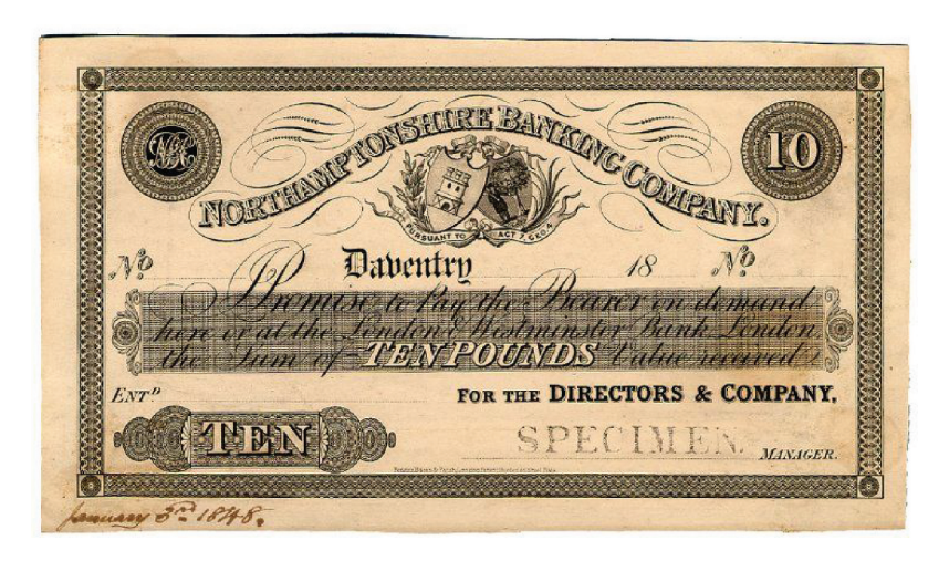
Figure 5. Northamptonshire Banking Company 10 pound bank note, 3 January 1848.

The Northamptonshire Banking Company even paid homage to the legislative instrument which gave its notes life by including its name in the bank's crest. This is shown in Figure 5. The words 'pursuant to Act 9 Geo 4' can be seen along the ribbon on the crest at the top center of the note. This message was included on all the other notes issued by Northamptonshire Banking Company in the collection.<sup>21</sup> Links to law and legal rights gave the notes a sense of legitimacy and this detail acted as proof that the 'promise to pay the bearer on demand' was