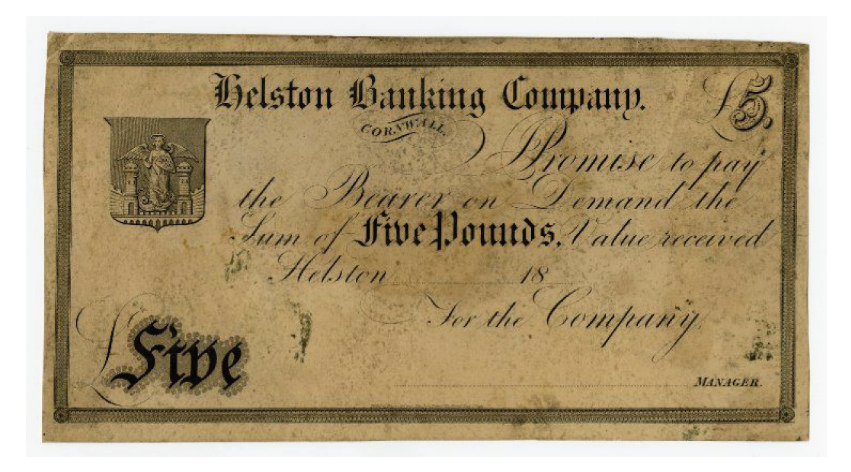
Figure 4. Helston Banking Company 5 pound bank note (1836–1878).

are likely to have resembled those of Helston castle, which was built for the Earl of Cornwall in the thirteenth century and was ruined by the sixteenth century. In Christianity, angels symbolized virtue and goodness whilst dragons symbolized evil, or even Satan. St Michael slaying the dragon is to be found in the Book of Revelation (12:7–9) and associates dragons with serpents or snakes. Indeed, the Latin word draco means both dragon and snake (Hall 2008, 113, 214–15). An angel slaying a dragon thus symbolized virtue defeating evil and would have had a direct bearing on cultivating an image of a reputable, trustworthy bank.