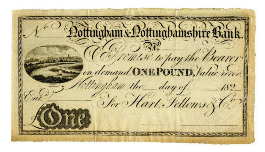
Figure 1. Nottingham and Nottinghamshire Banking Company 1 pound note, 1820–1829.

Indeed, images of local places, buildings and landmarks were common across joint stock bank notes. A Nottingham and Nottinghamshire Bank note, is shown in Figure 1. The Nottingham and Nottinghamshire Banking company was founded in 1833 and had established five branches by 1836.<sup>10</sup> It survived as a successfully independent institution into the twentieth century, when it was taken over by the London, County, Westminster and Parr's Bank Ltd. (Orbell and Turton 2001, 421). The image on the bank note contained a view of the River Trent, clearly identifiable by those who knew the town. Nottingham was a center for hosiery and lace manufacture and the River Trent, as well as linking canals, permitted the transportation of manufactured goods to internal and external markets. Hosiery was taken for export via water to the northern eastern port of Hull. These waterways were also vital in the transportation of coal from the North Nottinghamshire and Derbyshire coalfields. The River Trent was thus a key part of the local landscape, and a signifier of trade and economic activity. A church can also be seen on the horizon. More prominently is Nottingham castle, perched on a sandstone cliff, and instantly recognizable as a prominent part of the local landscape (Church 2006).