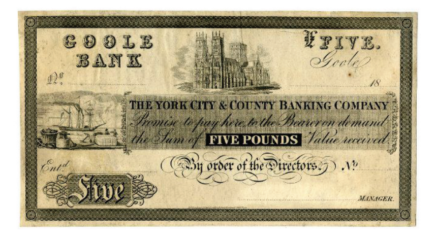
Figure 2. York City and County Banking Company 5 pound note, Goole branch, 1830–1883.

Sketches of a town or city and its landscape were not only useful in visualizing the ties between owners. These markers of identity were part of a process that gave rise to a notion of community among note holders. Those engaged in the buying and selling of goods or services would have exchanged the notes and given them to one another. The experience of viewing the imagery on the notes was a shared one. The bank notes shown here were promissory notes. Each bore the statement that the note was a 'promise to pay the bearer on demand'. It followed