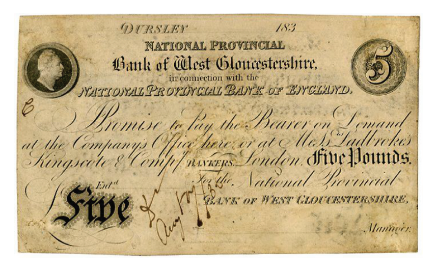
Figure 6. National Provincial Bank of England Dursley 5 pound, note 1830–1839.

issuing rights within London. This plan was ultimately not successful, but such an aim was not unreasonable. A system, such as the one proposed by Joplin, existed across the border in Scotland (Checkland 1975; Munn 1980). There were good reasons to argue that the English banking system should imitate the Scottish, as Scottish banks had not suffered as much as the English in the 1825/6 crisis (Neal 1998; Turner 2014). It remains a subject of debate and it is not clear whether the legal position of the Scottish banking system was the reason for its stability (Acheson, Hickson, and Turner 2011; Freeman, Pearson, and Taylor 2013). National Provincial was by no means a bank personally sanctioned or approved by the King. This was provided only to the Bank of England. Yet, the image of the head of state on the note in Figure 6 suggested that it might have a close and intimate relationship with political power.