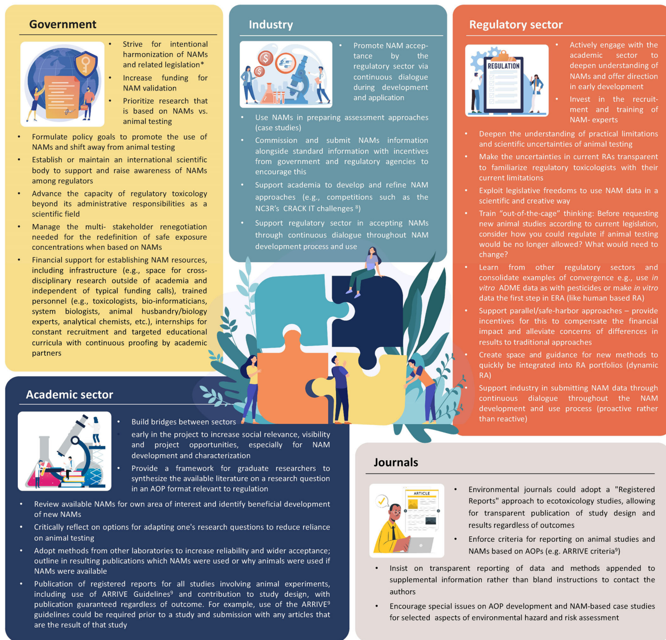
FIGURE 2: Suggested activities by various stakeholders which could support the necessary change toward the increased use of new approach methodologies. NAM = new approach methodology; NC3R = National Centre for the 3Rs; RA = risk assessment; ADME = absorption, distribution, metabolism, and excretion; ERA = environmental risk assessment; AOP = adverse outcome pathway; ARRIVE = Animal Research: Reporting of In Vivo Experiments.

interest which benefited developments in ERA is supplied in the Supporting Information. Focusing on the past 10 years, only works that might reasonably be considered to contribute to advancements in the field or methods of particular special contemporary interest and importance are highlighted.