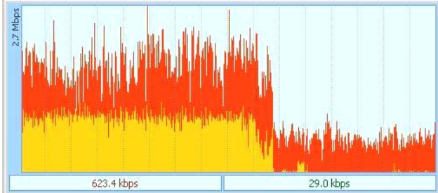
Figure 3. Traffic: fall back from HSPA (left) to standard UMTS (right) for a 15 minute window.

system initiated a fall back to standard UMTS (3G). The maximum speed of UMTS is about 384 Kbps. Practical measurements, however, indicated that the data rates did not exceed an average of 200 Kbps download and 90 Kbps upload. Fig. [3] shows the reduction in speed as the moving vehicle, cruising at a speed of 30 Km/h moves away from the HSPA coverage and into a UMTS area.