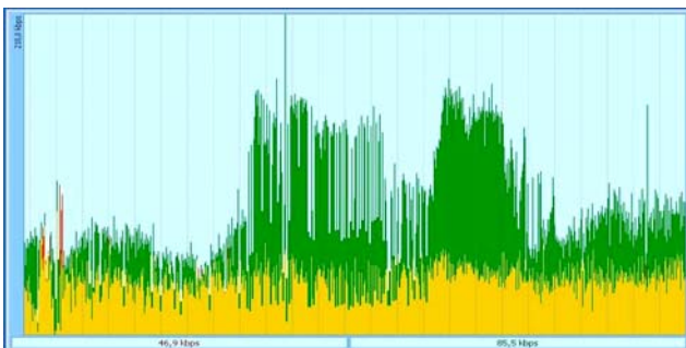
Figure 4. Bandwidth fluctuation in congested areas (15 min window).

By keeping the ambulance in the city center, we forced it to use links that were already utilized by several other users. This is a more realistic approach as, in time, these networks will be used extensively. For this scenario, the data rates available were comparable with the non-congested links but had a much higher fluctuation both in bandwidth and in total delays. Bandwidth available averaged at 1 Mbps for downlink and 200 Kbps uplink with delays varying between 200 and 1300 ms. This resulted in the videoconferencing sessions to have varying quality (while the algorithm adjusted the compression ratio to fit the available bandwidth) and a frame rate ranging between 3 and 18 fps.