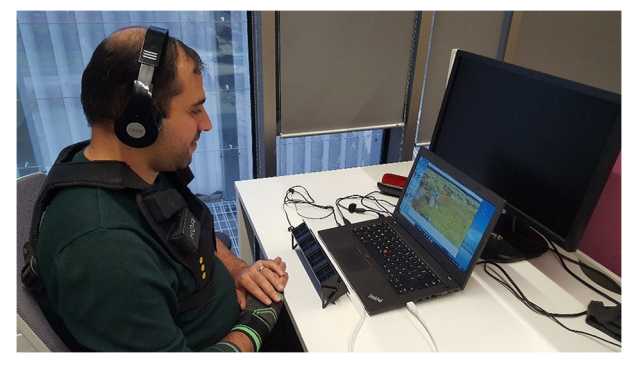
Fig. 1 A user taking part in the experiment

gender and education influence a user's satisfaction and enjoyment of mulsemedia applications we analysed the impact of each on self-reported QoE (Table 5). To this end, we undertook an Analysis of Variance (ANOVA) test with age, gender and education as independent variables and the user QoE responses as dependent variables. The result of this analysis is shown in Table 6. Finally, we undertook a Pearson correlation test to investigate links between participants' smell sensitivity (Table 4) and their self-reported QoE (Table 5).