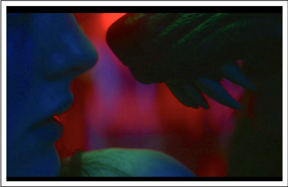
Figure 1. Kissing Candice (2017) Directed by Aoife McArdle. Cleveland, OH: Gravitas Ventures (1:11:02).

empty church while on the run, she signals her distinction from the previous generation of her mother, who prays ‘and clean[s], it’s all she ever does’ (1:21:32). The film ends ambiguously with Candice and Jacob in a catastrophic car crash, suggesting victory to the angered, marginalised classes. But, in the film’s closing moments, ‘the gaze is redirected from the gangster to the – now liberated – victim, as Candice’s subconscious takes over the screen, a hyperreality rooted in egalitarian compassion’ such that a ‘more democratic, ungovernable and chaotic sublime’ is able ‘to escape the boundaries of the frame’ (Asava, 2022).