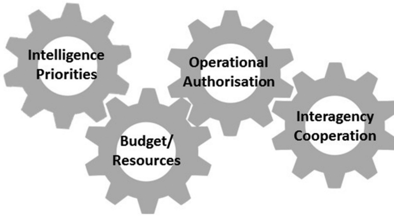
Figure 1. Components of mandate-level functions.

that could detrimentally impact foreign policy, require higher levels of authorization. For instance, the US Foreign Intelligence Surveillance Act of 2008 (FISA) requires that the intelligence community provide justification for the electronic surveillance of targets located outside of the United States.