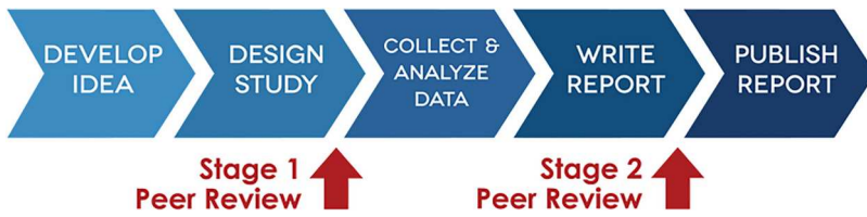
Figure 1. Registered Reports process.

(Chambers & Tzavella, 2022). Ten years later, the format has now been offered at over 300 journals. While the majority of journals that offer RRs are focused on psychology, they have also been used in areas as diverse as business and economics and cancer biology (Center for Open Science, 2024; Montoya et al., 2021). The uptake of the format within health-related journals has been relatively limited to date, particularly within health psychology (Center for Open Science, 2024), although these are offered by the British Journal of Health Psychology and Psychology & Health and had also been offered by the now defunct Health Psychology Bulletin .