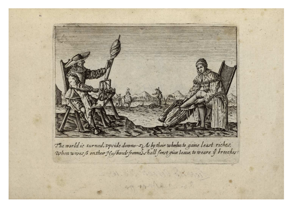
Figure 1. 'The world is turned, upside downe'.