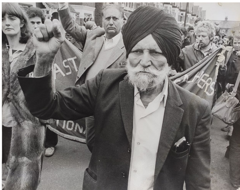
Figure 2. Demonstrators pay tribute at the place where Blair Peach was killed in 1979.

unpleasant jobs that local workers were not there to do or could choose not to do, passed the racists by.)