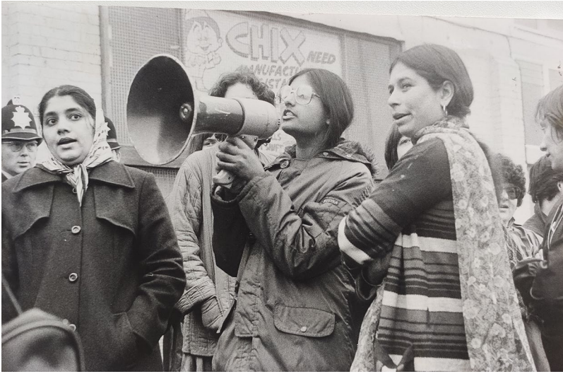
Figure 3. Southall women support the Slough Chix strike at a confectionery factory in 1979.

demolished within months under the leadership of Ealing council – in fact, its Conservative leader was to be awarded an OBE for ‘community relations’.