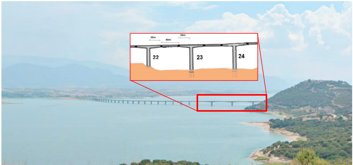
Fig. 1. General view of the Polyfyto lake and the bridge with the detail of Piers #22, #23, #24.

This approach, while not conclusive on its own, offers reliable information to engineers and the infrastructure operators, offering a digitally streamlined, cost and time efficient, and environmentally friendly solution with minimal structural interaction.