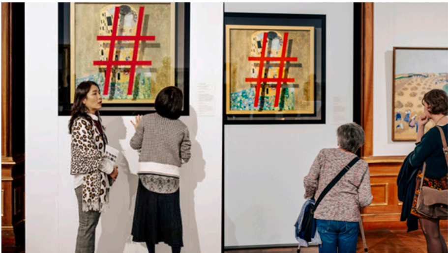
Fig. 2. Red hashtag placed in front of famous Klimt in Vienna. (Source: Vienna Tourist Board, 2019).. (For interpretation of the references to colour in this figure legend, the reader is referred to the Web version of this article.)

The Faroe Islands had not experienced mass tourism until the last few years, when images of the islands' scenic landscape began to circulate online (Karantzavelou, 2019). Due to its small population size of 52,154 (Statista, 2020), it would be easy for the tourist numbers to outweigh those of local population. Indeed, the Faroe Islands average 110,000 visitors per year ("Why We're Closing - Again," n.d.). The tourist board surveyed the locals about their general feelings towards tourists, and to determine if they felt that there was overcrowding or had other complaints and those who lived in specific photogenic locations had a greater tendency to experience incidents of photography-seeking travelers negatively impacting their daily lives and, in some cases, damaging their land. In one incident, a shepherd tending his flock on a privately-owned mountain range claimed that his work was regularly