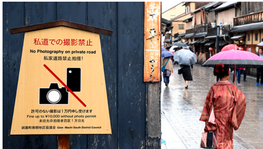
Fig. 4. Photography ban signage in Gion district of Kyoto, Japan.

intervention, because there was a penalty in place for visitors, there is still a choice.