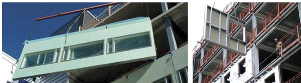
Figure 2. Installation of lightweight infill wall in a primary structural frame (images from SCI, 2008), (left): Prefabricated infill wall with cladding, windows, and light steel frame, and (right) prefabricated infill wall with exterior plasterboard, windows, and light steel frame.

There are several advantages of using the prefabricated, panelised infill walls over other ways of constructing infill walls, such as (a) enhanced safety of installation workers (installation from inside the structure, reducing working externally at height), (b) reduced costs (reduced mast climber and scaffolding requirements; the crane is not necessary), and (c) reduced site waste.