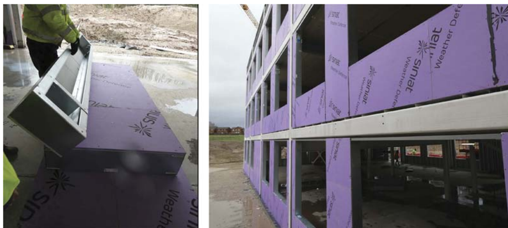
Figure 3. Prefabricated panelised infill wall with exterior plasterboard (photos taken by the authors on December 2021 in the Greater Manchester area, UK).