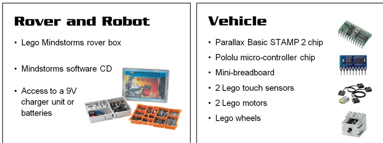
Figure 3. Slides from the 'MDP Information Pack' giving project kit inventory information

Rover and Robot themes have as their basis Lego Mindstorms robotics kits which include an array of sensors (touch, sound, ultrasound and light sensors), motors, wheels, tracks and additional parts that can result in a multitude of possible designs. The central control brick is programmed using Lego software on a laptop or PC, programmes being downloaded to the unit via a USB cable. The Vehicle projects use a Parallax Basic STAMP 2 chip which can be programmed to drive Lego motors via a Pololu micro-controller. A general Lego and electronic components resource is made available to all project teams throughout the MDP week, via access to an electronics laboratory from 09:00 – 17:00 each day. Figure 3 shows some of the kit information provided to the students before the project week.