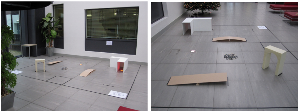
Figure 2. The MDP obstacle course layout

Each year there are around 450 students that take part in the MDP. The students are organised into 50 mixed discipline groups of 8 or 9 students and tasked with designing, building and demonstrating Lego Mindstorms and BASIC Stamp micro-controlled vehicles to tackle an obstacle course. The 50 groups are split into five 'themes', ten groups per theme, each of which has a selection of different obstacles and hazards to negotiate on a course along with specific challenges to complete, for example: autonomous or wireless control for navigating a specific route through the obstacle course, detection and intelligent avoidance of hazards on the obstacle course, identification, collection or transportation of target objects placed on the obstacle course.