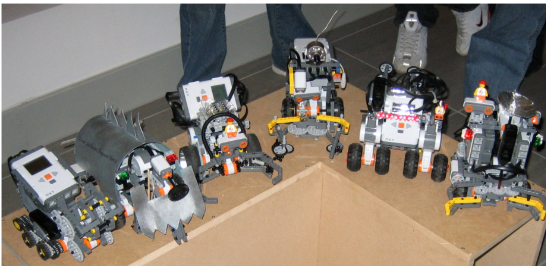
Figure 4. A selection of Robot theme projects from the 2007 MDP

The obstacle course is set up from the start of the MDP week to allow students to test their designs and is a hub of activity for the whole five days. Over the last two years the School has held open days for prospective engineering students during MDP week and a visit to the obstacle course to see the students working on their projects has become part of the tour, receiving positive feedback from parents who get to see what is going on.