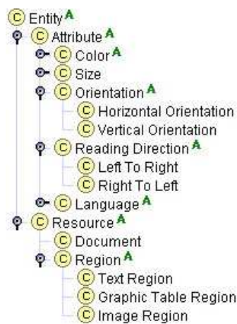
Fig. 2. A portion of the reference ontology for digital libraries.

region in the south part and an image region with 2 columns having an inner table". The query is then translated in OWL and matched against the document base. The user benefits from the use of a reference ontology in that the annotated document base can be put online and queried by other users referring to the same or another ontology if a mapping is provided. In order to facilitate this task, we mapped each concept of our ontology to WordNet [5], a de facto standard lexicalized ontology containing more than 120,000 concepts. WordNet encodes each concept as a set of English synonyms, called synset . This allows our system to accept free text queries and automatically map each keyword to a concept in the reference ontology. For the Italian language we used MultiWordNet [6], an Italian version of WordNet.