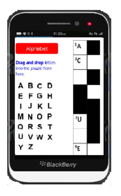
Fig 7. Adaptation of Crossword Puzzle for BlackBerry

The result of usability evaluation from the end user viewpoint (Table 3 above) also indicated that the usability of the cross-platform app remains an affected across the individual platforms when ignoring the impact of the form factor of each device.