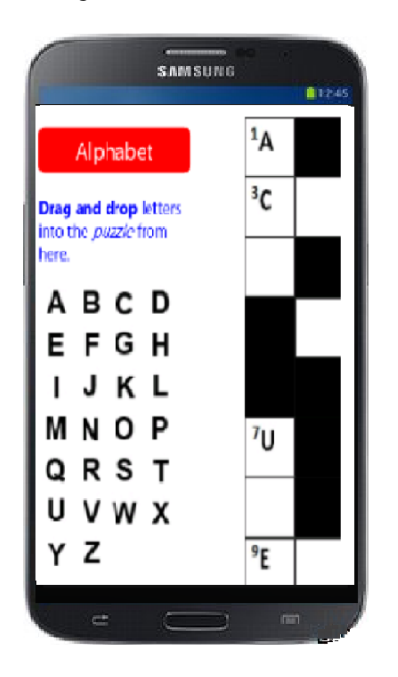
Fig 4. The Crossword Puzzle on Android Platform

adaptation efforts to maintain those features except that a few SDK configuration efforts have been made.