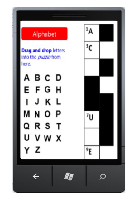
Fig 6. Adaptation of Crossword Puzzle for Windows Phone

Our finding pointed out that PhoneGap based crossplatform apps can be ported into other platforms with only limited SDK configuration efforts of the developer and hence usability from the developer viewpoint.