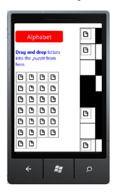
Fig 5. Distortion of Crossword Puzzle on Windows Phone

For example, among the SDK configuration requirements we encountered that images disappeared both from the alphabet pallet and the puzzle board (see Fig 5) when deploying on the Windows Phone. The' build action' file property of all images is converted from resource to content and the app was rebuilt into the proper features as shown in Fig 6.